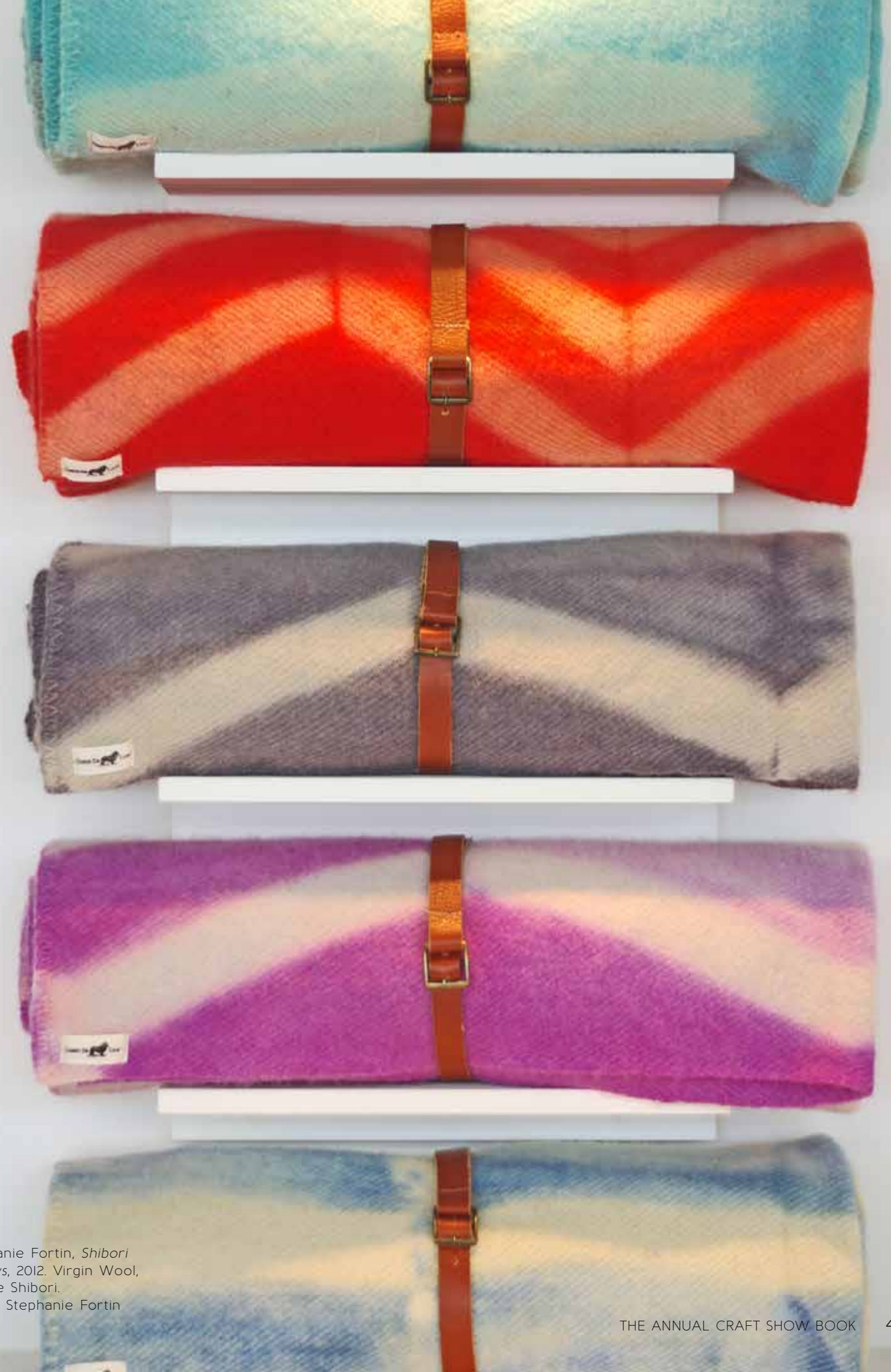
Stephanie Fortin, Shibori Throws , 2012. Virgin Wool, Itajime Shibori.

Studio tour maps can be downloaded from the tour's website, picked up at our supporting retailers or can be mailed by request.