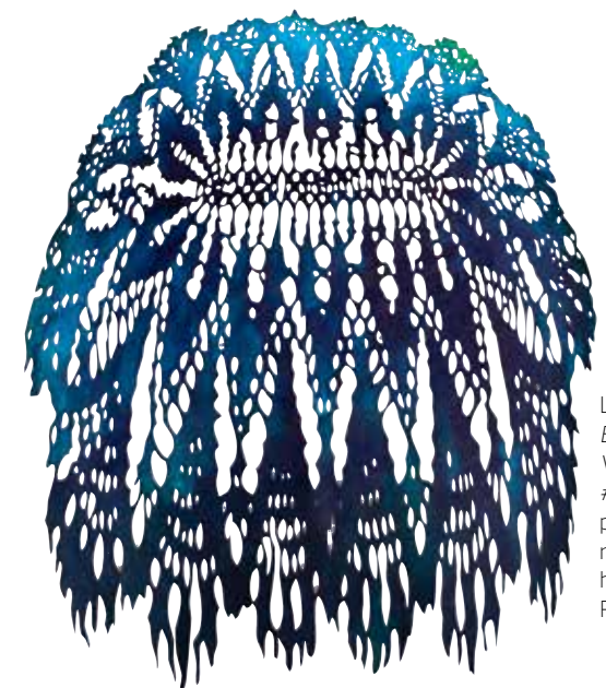
Lizz Aston, Exploding Lace View - Warp #1 , 2013. Kozo paper and fibre-reactive dyes, hand-cut

Organization Information: Thorold Secondary School c/o 25 Pamela Drive. Thorold, ON L2V 2X7 Phone: 905-227-7248 cathy.henderson@hotmail.com