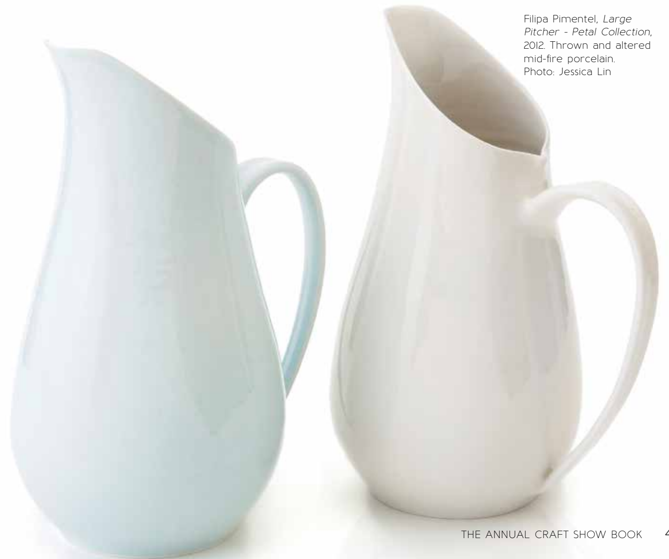
Filipa Pimentel, Large Pitcher - Petal Collection , 2012. Thrown and altered mid-fire porcelain.