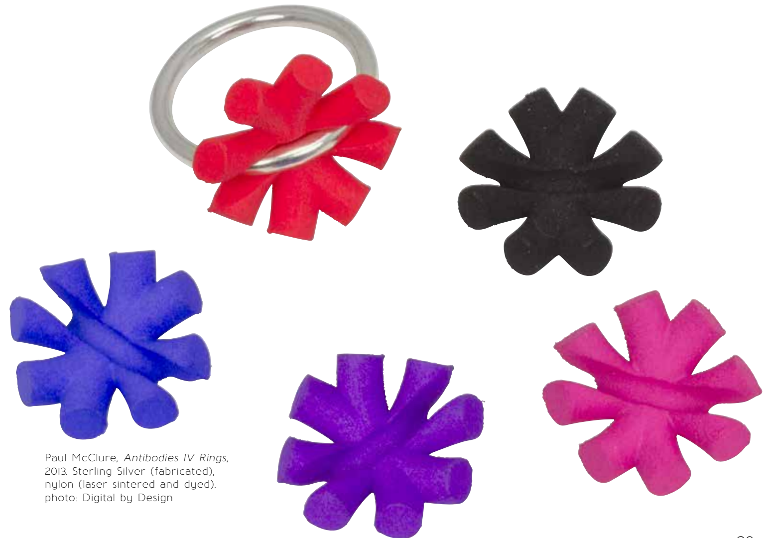
Paul McClure, Antibodies IV Rings , 2013. Sterling Silver (fabricated), nylon (laser sintered and dyed).