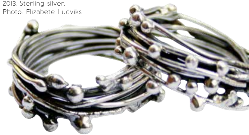
Elizabete Ludviks, Rings , 2013. Sterling silver.

Organization Information: Opt Holdings Ltd. 120 Wharncliffe Road South London, ON N6J 2K3 Phone: 519-679-1810 opholdings@bellnet.ca www.londoncraftshows.com