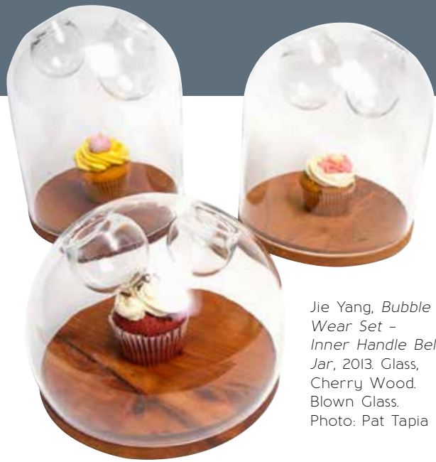
Jie Yang, Bubble Wear Set - Inner Handle Bell Jar, 2013. Glass, Cherry Wood. Blown Glass.