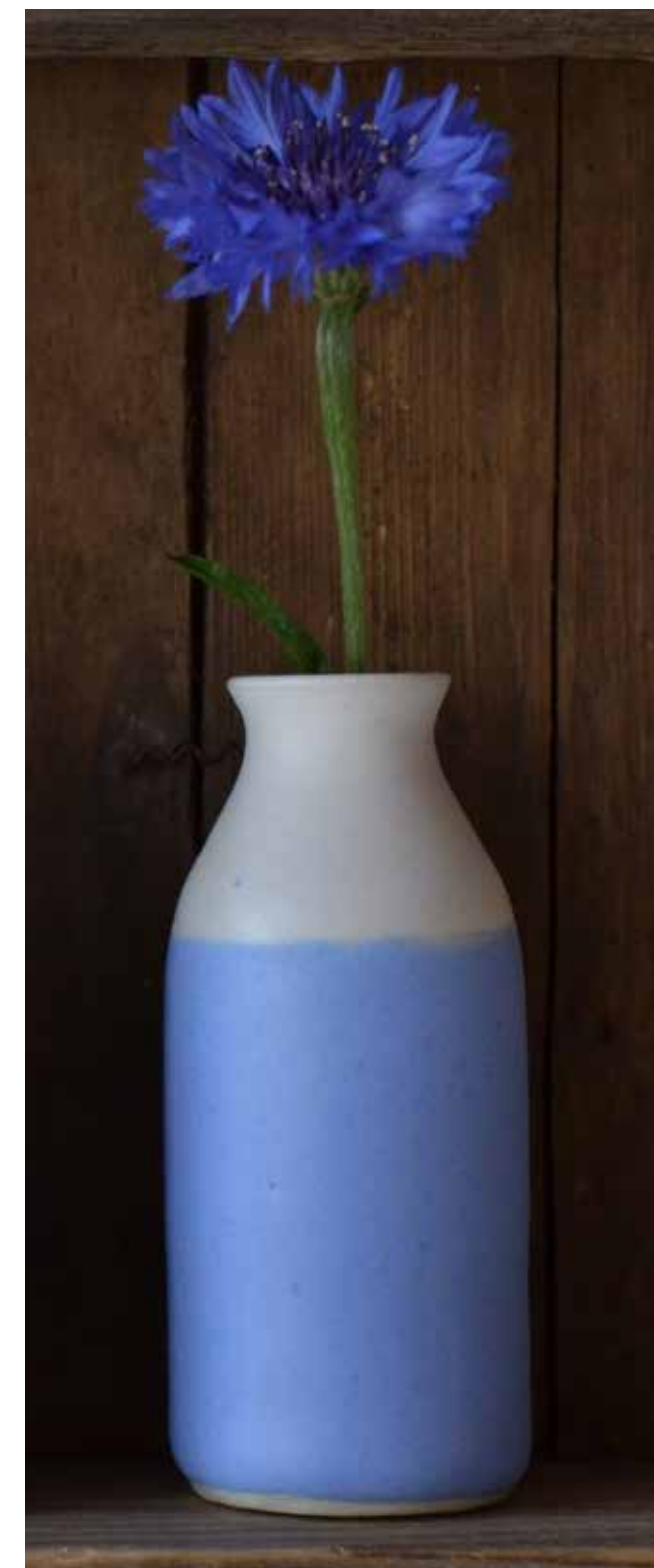
Akai Ceramic Studio, Vases, 2014. Glazed ceramic.

Organization Information: Winona Peach Festival PO Box #10505 Winona, ON L8E 5R1 Phone: 905-643-2084 ginadance@hotmail.ca