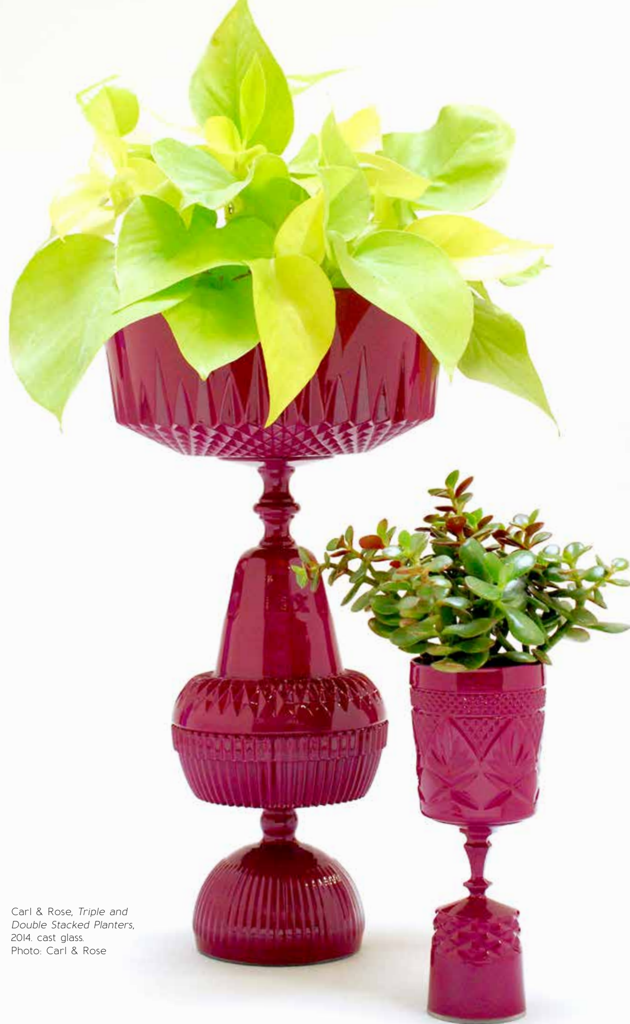
Carl & Rose, Triple and Double Stacked Planters , 2014. cast glass.